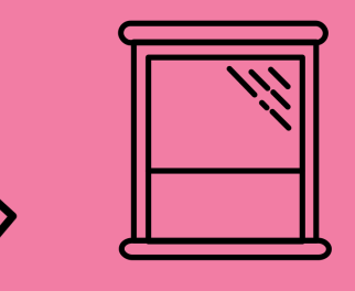
DOUBLE GLAZE WINDOWS