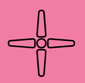
DC CEILING FANS